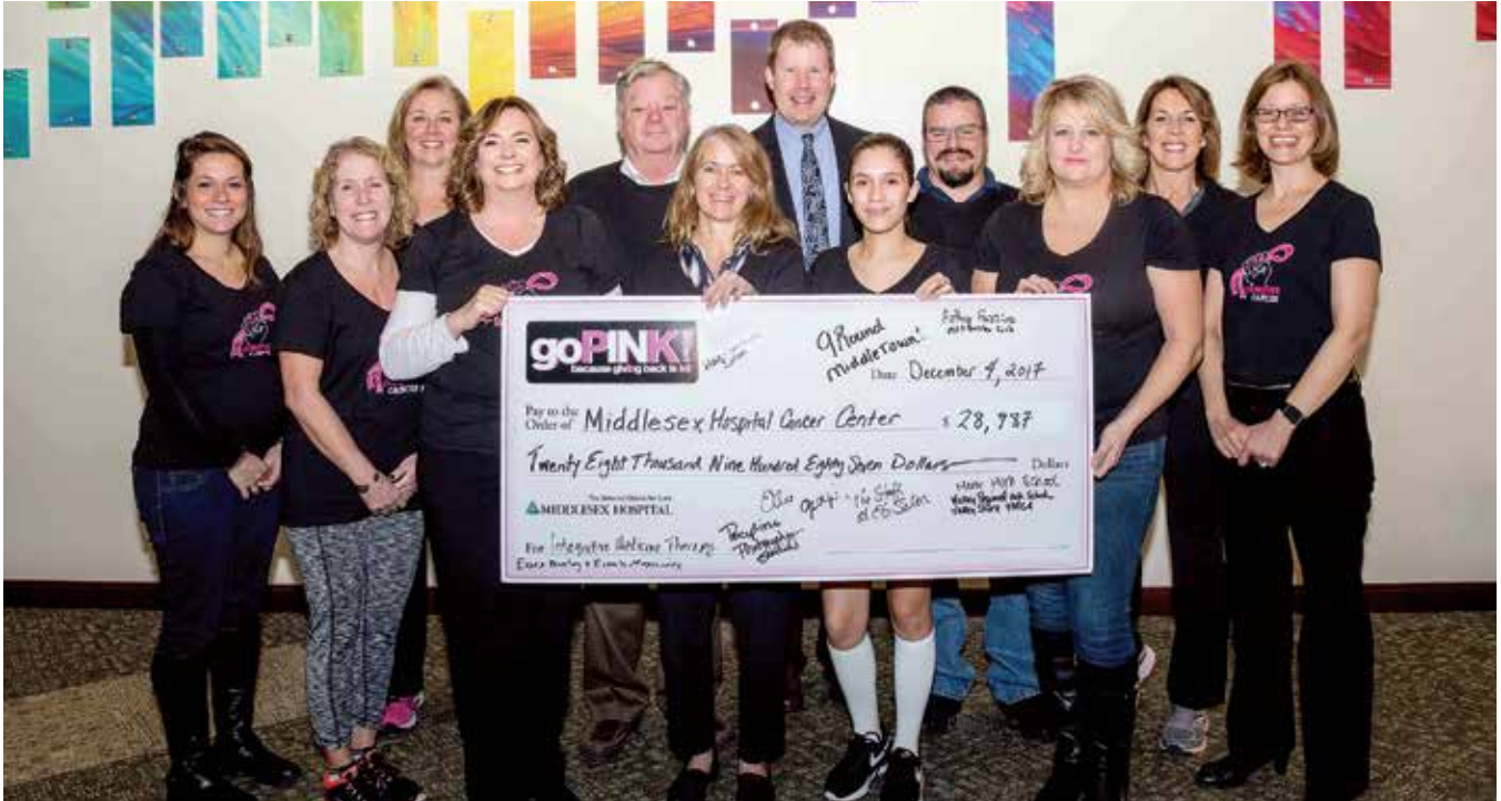
The 8th annual goPINK project raised over $29,000 to support women facing breast cancer at Middlesex Hospital Cancer Center. Since 2010, dozens of business, schools and teams have helped raise a grand total of $184,575 to provide free integrative medicine therapy to over 1,000 patients! Essex Printing and Events Magazines is a proud supporter of the goPINK project. For more information visit gopinkproject.com .