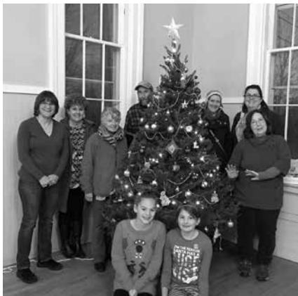
DTC (Willington Democratic Town Committee)