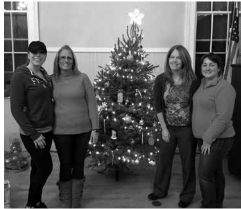
LPC (Local Prevention Council)